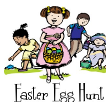
Easter Egg Hunt

OUR NEXT FAMILY NIGHT DEVOTIONAL: will be THIS Wednesday night at 6:30pm. It will involve a more interactive devotional to encourage everyone to come, be involved and participate with ALL the ages and generations.